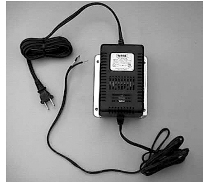
Multi-Unit Power AC Adapter & 24" Wire Lead

Model: 104401 (adapter), 104402 (wire lead)